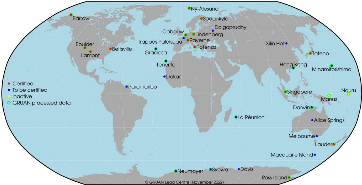
Figure 2. Current GRUAN network configuration as of November 2022.